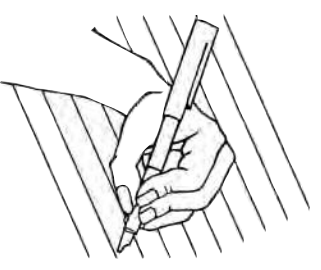
This hand is twisted so the pen comes from above the line of writing.